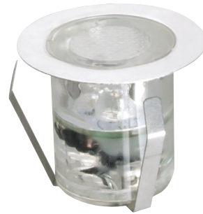
E1030-WH Cut out: 21mm