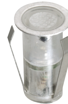
E10PEN-WH Cut out: 11mm